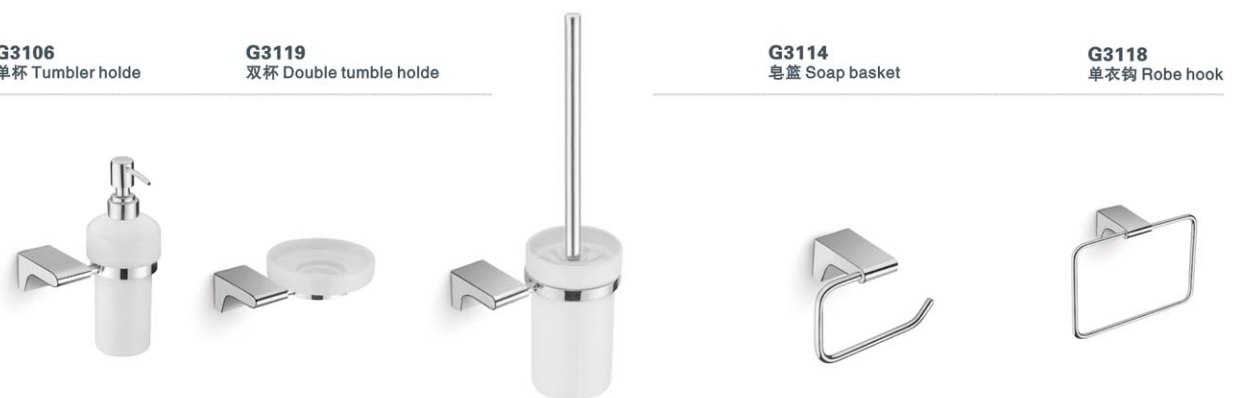
G3111 皂液器 Soap dispenser