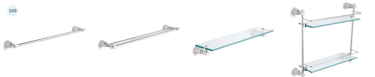
G3301 单毛巾杆 Single towel bar