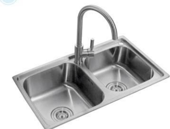
G6939A 洗菜盆 Bangke 尺寸/Size: 690x390x220mm 开孔尺寸/Size: 650x350mm