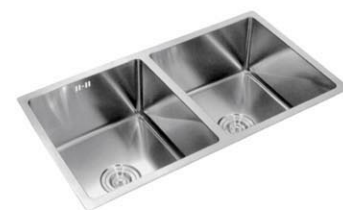
G8345B 洗菜盆 Bangke 尺寸/Size: 830x450x230mm 开孔尺寸/Size: 790x410mm