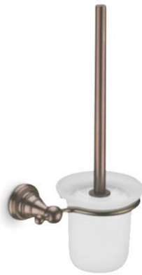
G3612 马桶刷 Toilet brush holder