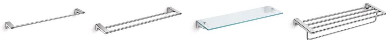
G3101 单毛巾杆 Single towel bar