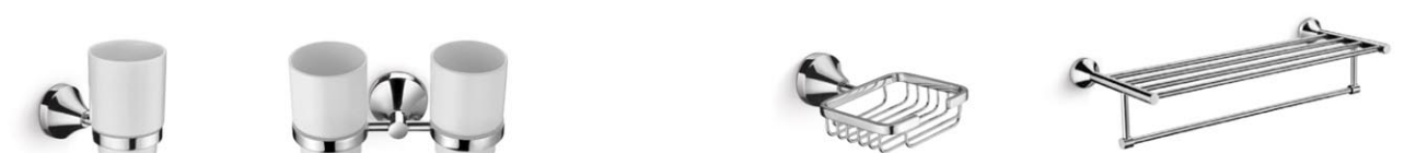
G3206 单杯 Tumbler holde