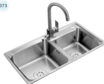
G7742 洗菜盆 Bangke 尺寸/Size: 770x420x220mm 开孔尺寸/Size: 730x380mm