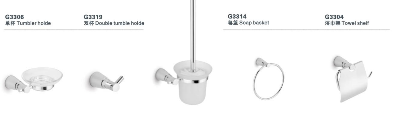
G3308 皂碟 Soap dish holder