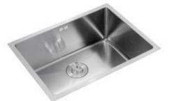
G5945 洗菜盆 Bangke 尺寸/Size: 590x450x230mm 开孔尺寸/Size: 550x410mm