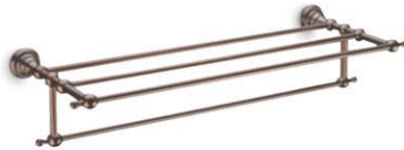
G3604 浴巾架 Towel shelf