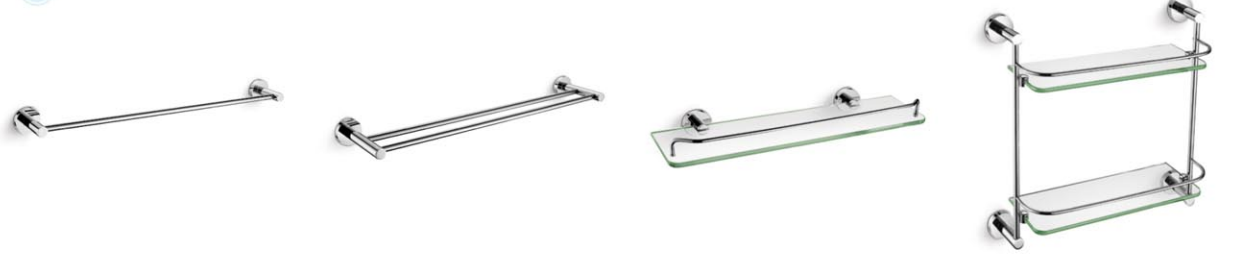
G3501 单毛巾杆 Single towel bar