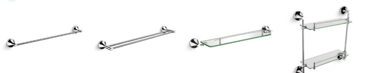
G3201 单毛巾杆 Single towel bar