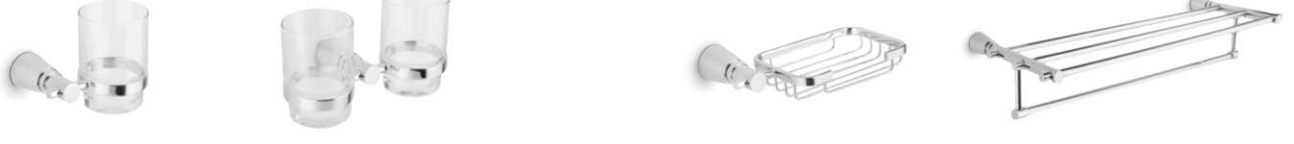
G3306 单杯 Tumbler holde