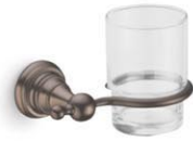
G3606 单杯 Tumbler holde