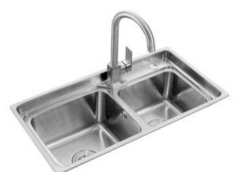
G7741 洗菜盆 Bangke 尺寸/Size: 770x410x245mm 开孔尺寸/Size: 730x370mm