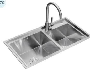
G7843 洗菜盆 Bangke 尺寸/Size: 780x430x230mm 开孔尺寸/Size: 740x390mm