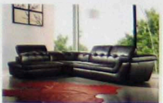
MODEL NO: 397