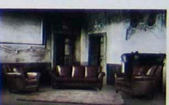
MODEL NO: 2239