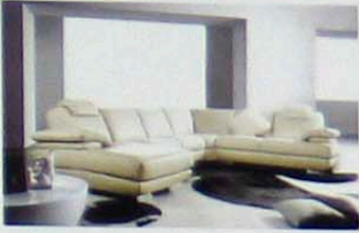
MODEL NO: 091ang