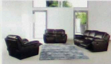
MODEL NO: 324