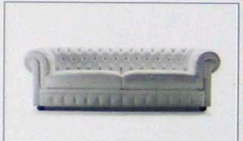
MODEL NO: SIR WILLIAM