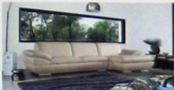
MODEL NO: 269ang