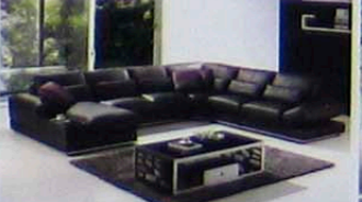
MODEL NO: 942