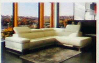
MODEL NO: 528