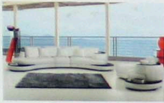
MODEL NO: 109