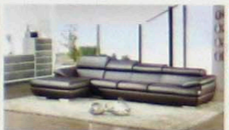
MODEL NO: 713