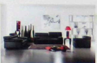
MODEL NO: 381