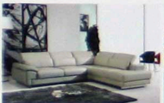
MODEL NO: 515