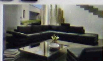
MODEL NO: 614