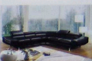
MODEL NO: 962