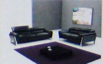
MODEL NO: 798