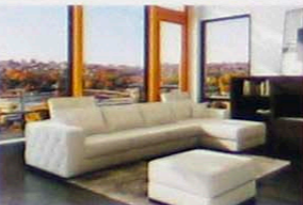
MODEL NO: 570