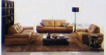
MODEL NO: 666B