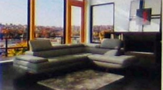
MODEL NO: 959