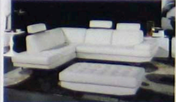
MODEL NO: 633-1