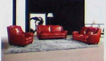
MODEL NO: 4086