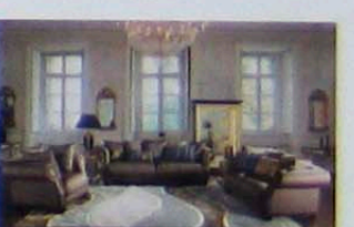
MODEL NO: 4553