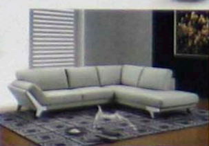
MODEL NO: 533