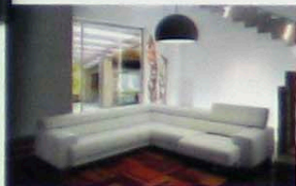
MODEL NO: 171ang