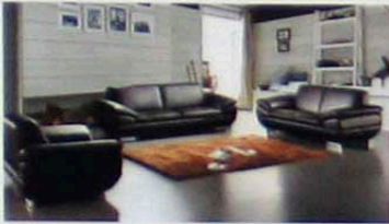
MODEL NO: 269