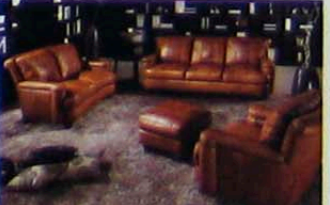
MODEL NO: 2493