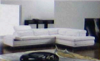
MODEL NO: 958