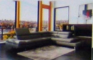
MODEL NO: 963