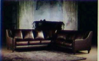
MODEL NO: 3024