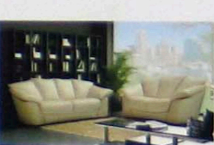
MODEL NO: 555B