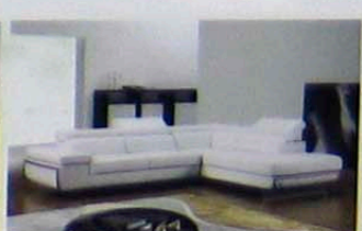
MODEL NO: 965