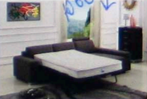
MODEL NO: 580