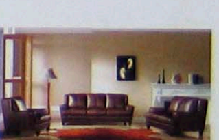
MODEL NO: 4212