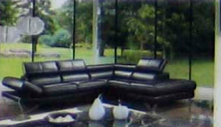
MODEL NO: 800