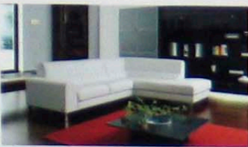
MODEL NO: 216ang