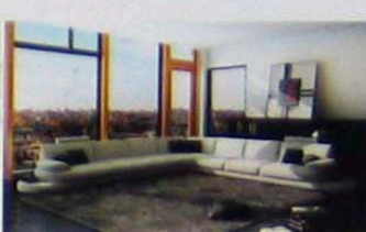
MODEL NO: 954