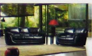
MODEL NO: 558