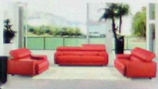
MODEL NO: 171