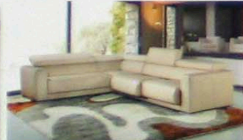
MODEL NO: 376