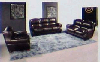
MODEL NO: 2934